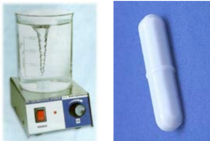
Figure 1: Magnetic Stirrer and Stirring Bar

The method used to capture the high-speed photograph of agitated milk was fairly straightforward and is easily reproducible. To begin the photograph, 2% milk was removed in a large glass and allowed to reach room temperature. It was discovered that the room temperature milk mixed faster and more complete with the room temperature dye than that of cold milk. Once the milk reached room temperature a large amount of blue dye was added to the milk with a few drops of green to develop turquoise milk as seen in the original image located at the end of the report. A small amount of this milk was placed in a glass salad bowl with a base diameter of 3 inches to a depth of \frac{3}{4} of an inch. This bowl with the dyed milk was then placed over a magnetic stirrer with the 1.5 inch stirring bar placed inside of the glass bowl. A magnetic stirrer is a device that used a small stirring bar placed inside the device containing the liquid to be stirred. This stirring bar is then rotated by way of a magnet rotation below the magnetic stirrer plate resulting in the liquid contained in the vessel to be rotated and subsequently stirred. An image of a magnetic stirrer with stirring bar can be seen below.