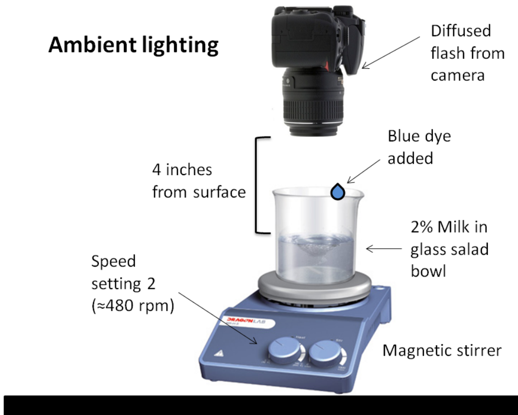
Figure 2: Photographic apparatus

Once the salad bowl containing the milk was properly aligned over the magnetic stirrer, the device was turned on and the speed was adjusted to form visible agitation of the milk while avoiding large instabilities such as large splashing of the milk or un-uniform structure of the milk. The speed at which this agitation was achieved while maintaining uniformity and stability of the milk was determined through trial photographs. This consisted of taking several images at a high shutter speed a various speed settings of the magnetic stirrer. This speed was determined to be at the speed level of two or roughly 480 rotations per minute. The camera was then held directly overhead and images were captured at a shutter speed of 1/1600 sec. The only lighting used was the ambient lighting in the room with the addition of diffused light from the flash obtained by taping a tissue to the flash of the camera. Finally, each photographic session lasted approximately 5 seconds before too much air was introduced to the system and the milk became saturated with bubbles. This was then repeated several times until sufficient images were obtained. A representation of the photographic apparatus can be seen below.