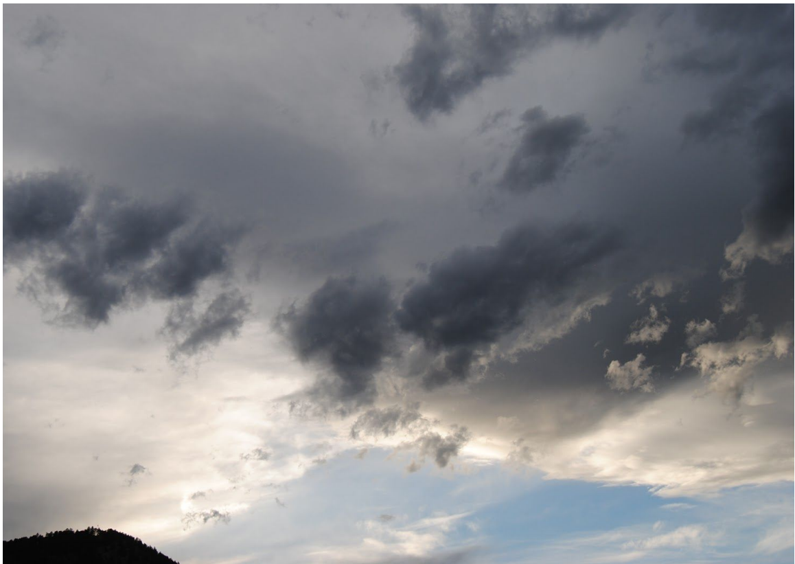
Fig 1. Unedited raw image with resolution of 2896 x 1944 pixels.

final settings were ISO-100, shutter speed 1/200 secs, and aperture 4. Final edited image has an a 1.15 saturation ratio and a 2.25 contrast ratio.