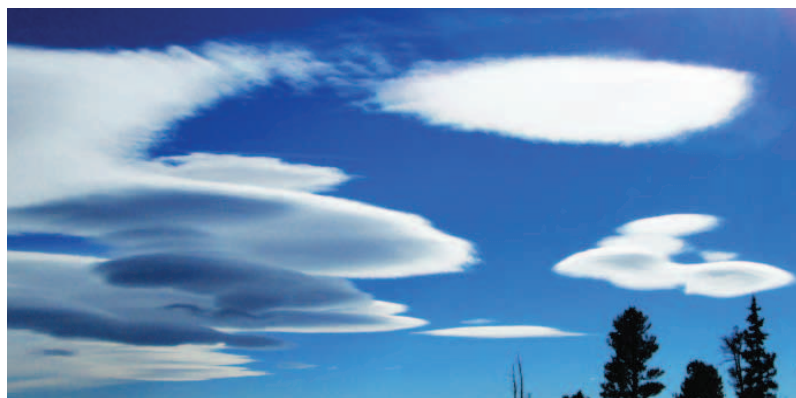
Fig. 3. Student work from Flow Visualization course, 2013. Altocumulus lenticularis (mountain wave clouds) form as air streaming over the Rocky Mountains bounces over Eldora, CO, 20 January 2013 at 1:30 pm. Assignments that require capturing existing fluid phenomena, such as clouds, encourage expanded perception. (© Jean Hertzberg. Photo: Anna Gilgur.)