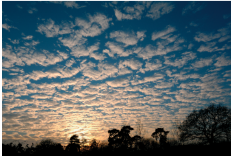
Figure 1: Altocumulus stratiformis translucidus perlucidus in the late afternoon of 18 December 2007 at Horsham (West Sussex). This cloud is transparent and has gaps between the cloud elements.[2]

The clouds in the picture should be identified as cumulus and altocumulus. From the image one can easily identify the cumulus clouds in that they always appear puffy, dense and sometimes resemble a cauliflower. In meteorology, the cumulus cloud is categorized as a type of low-level cloud. The formation of cumulus clouds has something to do with atmospheric convection.