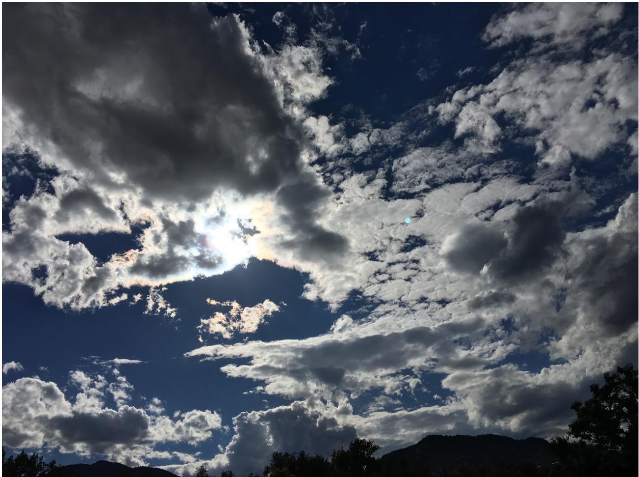
Figure 3: The original image

I took the image with my iPhone 6s Plus and I think it did a good job even if doesn't have a professional lens. I was standing on the 2nd floor of the Athens Court and the camera was facing south-west towards the mountain. The distance from the clouds I was trying to capture to the smartphone lens was probably 5,000ft-6,000ft based on the visibility on that day. The lens has been tilted a little bit to make sure more clouds were presented in the image. The original image has a resolution of 4032x3024, a focal length of 4.15mm, an f number of f/2.2 and an ISO of 25. The image was edited using a popular app "Polarr Editor" and some parameters have been fine-tuned to improve the quality of the image.