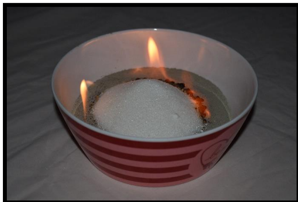
Figure 1. The mound of sugar and baking soda seconds after igniting the lighter fluid

The experimental setup can be visualized in Figure 1 .