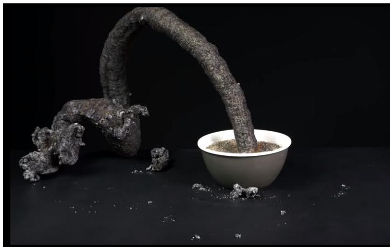
Figure 2. Black Snake experiment from https://www.youtube.com/watch?v=Hibxz9_ZW18

We were expecting to see something similar to the black snake shown in Figure 2 .