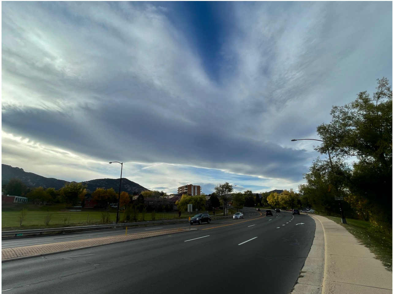
Figure 1: Stratus and cirrus cloud formation Boulder, CO - October 22nd, 2021 at 4:26 PM