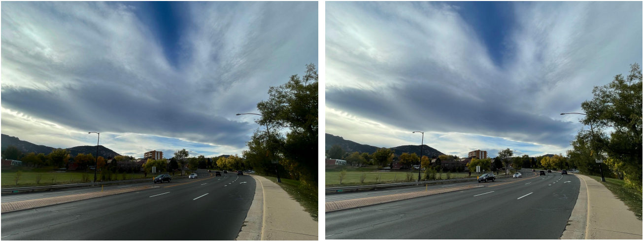
Figure 4: Edited vs original images (left to right)