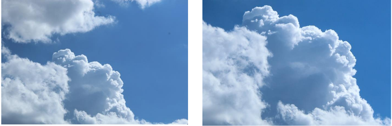
Figure 3: The original (left) and edited version of the photo (right).

Overall, I really like this image. The range of color in the cloud helps to display the differences in thickness. I think the framing of the image, with the cumulus peering out from behind the stratocumulus, shows how the two clouds can form at multiple elevations. Most of all, I like how crisp the edge of the cloud came out. I feel it helped to showcase the clouds unique texture.