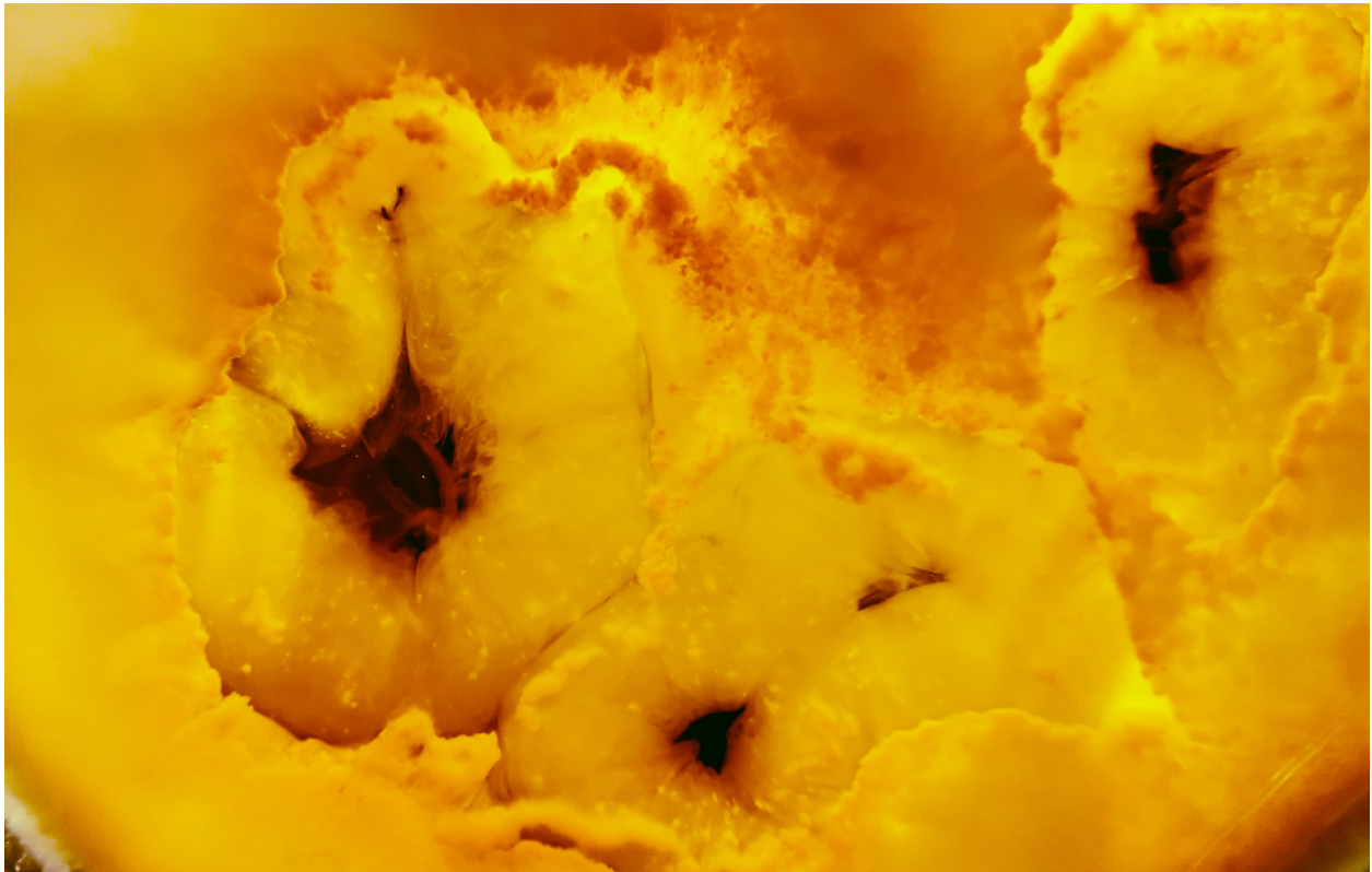
Figure 1: A screenshot from the final video of solutal convection currents in coffee liqueur.