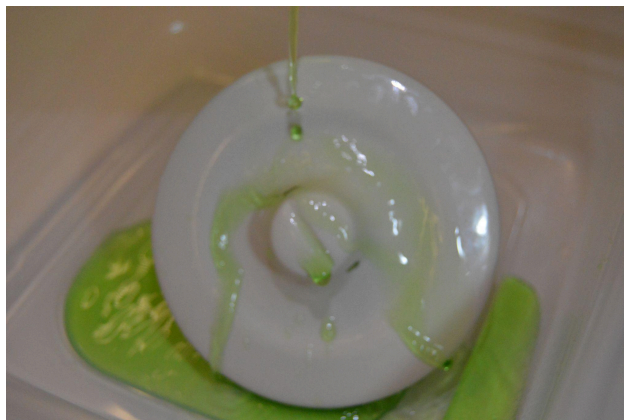
Fig. 3: Setup of Flow Visualization

The set up for this experiment was rather rudimentary due to working in a group and having to capture 3 individual images for each team member. The ITL has an all white plastic backdrop that we found in the basement and were able to use to create focus on the object and its flow. To replicate this it is possible to create a backdrop of white towels that will allow for similar lighting and focus. Below is a better image of the setup, in which we used a plastic container to pour the liquid into and a formed structure made of laser cut rectangles to hold the objects in the air or at an angle. We struggled with lighting a little bit due to the ITL's overhead lighting which created problems with capturing only one light source but with the help of multiple team members we were able to achieve proper lighting with two flash lights and constant angle adjustment. The hardest part of setting this up was lazer cutting out rectangles to hot glue together and onto the tupperware so that the object would be suspended. I would recommend a different method, perhaps using a glass or different clear object that doesn't need manufacturing.