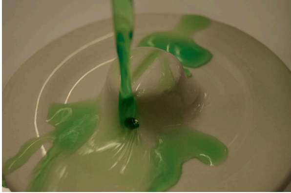
Fig. 4: Edited