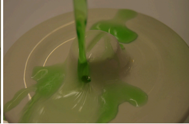
Fig. 5: Raw Image

I believe that initially this project seemed like I wasn't going to have a phenomena to relate to these images, it ended up being successful. Although I think there are better ways to demonstrate this property of suction, this was accidental and was a perfectly timed shot to show the pressure differential. Going forward I will think through the logistics of my projects more before attempting them and really contemplate the phenomena I'm looking to simulate.